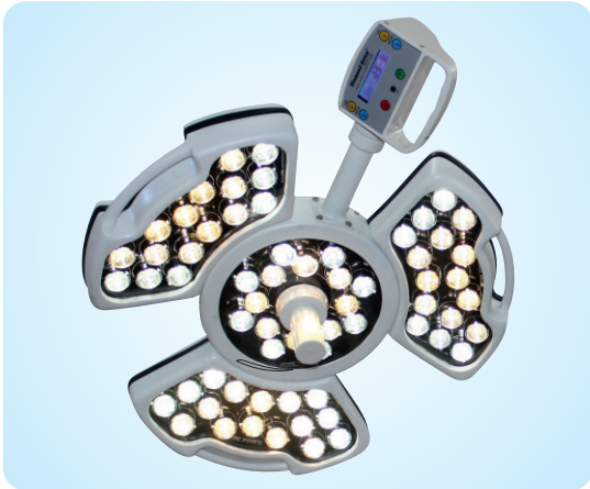
Model : Petal 3 Dome