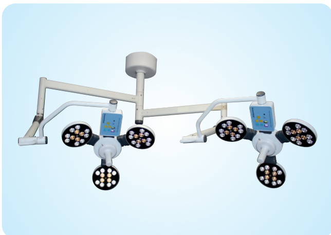
Fine Lux 33