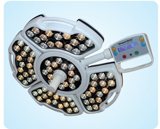
Model : Petal 4 Dome

Petal Series adap ts latut technology with finland optics, bulks from Germany alongwith front safety glass from Mitsubishi Japan.