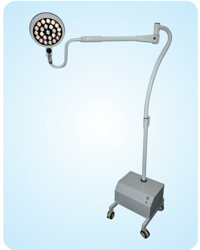
Micro M with Battery Backup