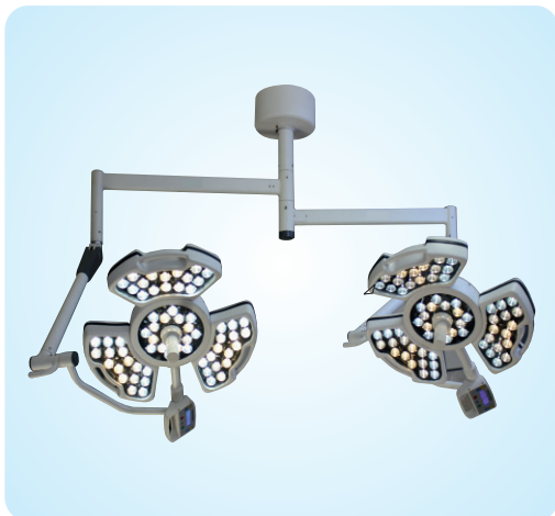
Model : Petal 33