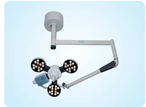
Fine Lux 3