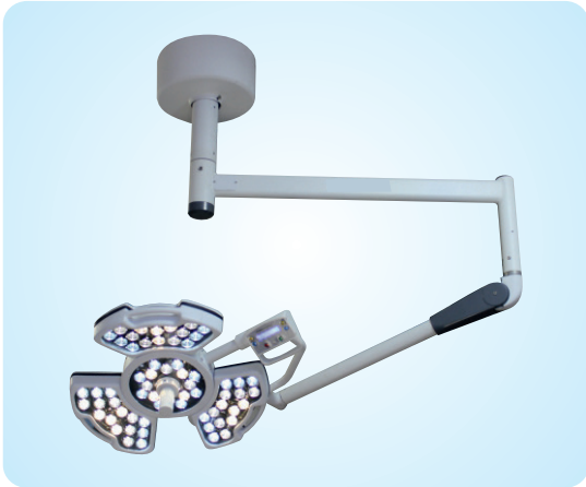
Model : Petal 3