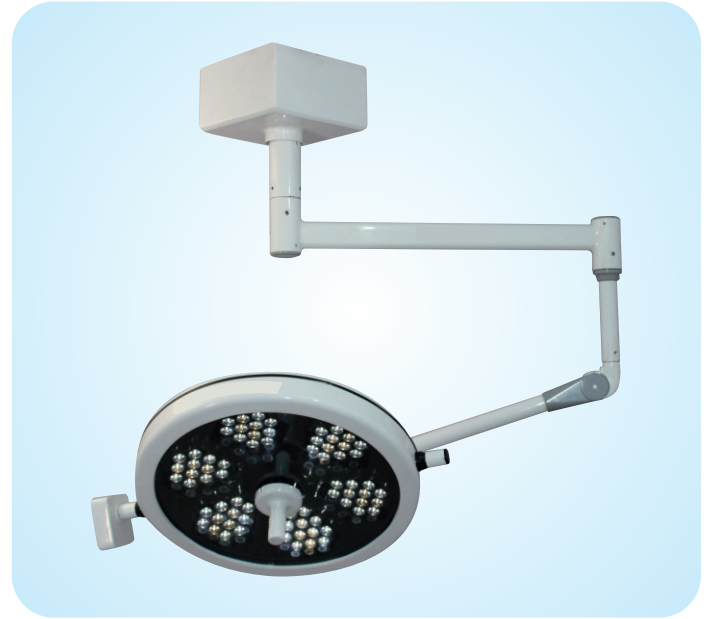
Model : Glow 60