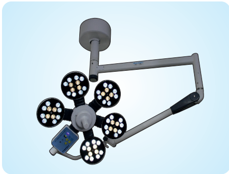
Fine Lux 5