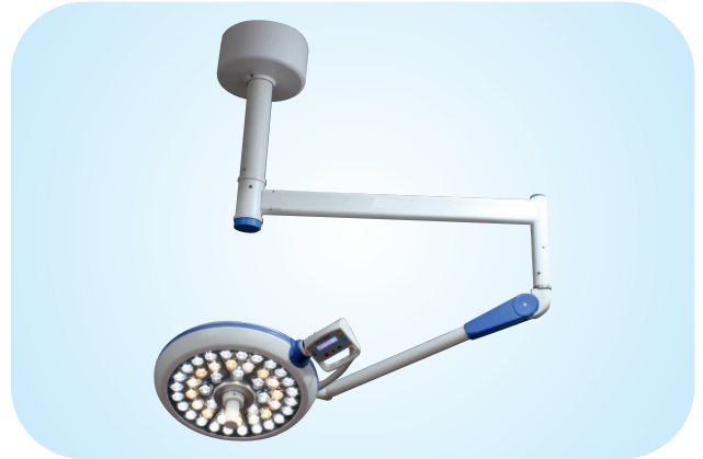
Model : Macro 500