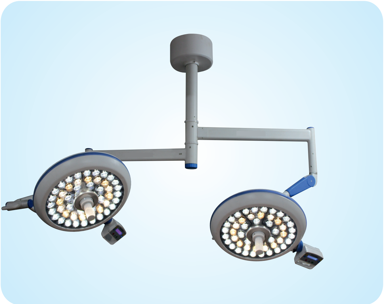
Model : Macro 500/500