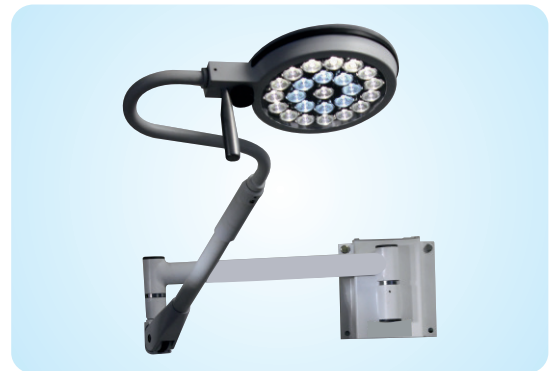
Micro Wall Mount (Space Saving Design)