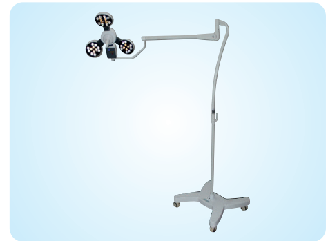
Fine Lux 3M