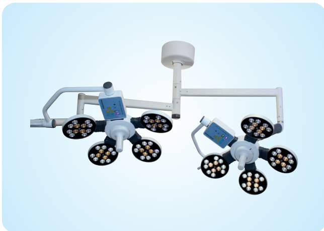
Fine Lux 44