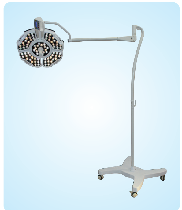
Model : Petal 4M