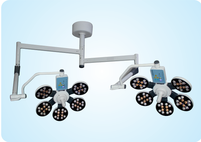
Fine Lux 55