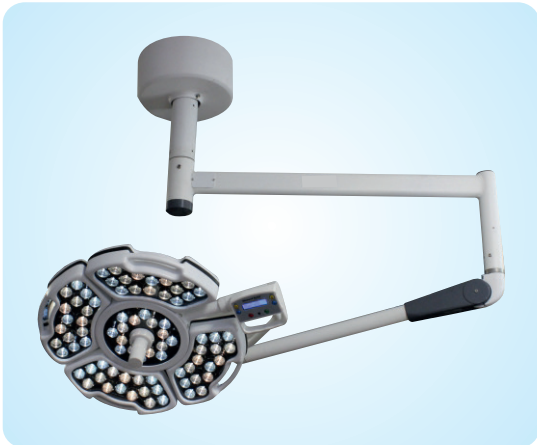
Model : Petal 4