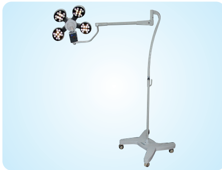
Fine Lux 4M