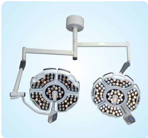
Model : Petal 44