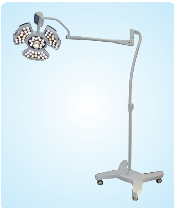
Model : Petal 3M