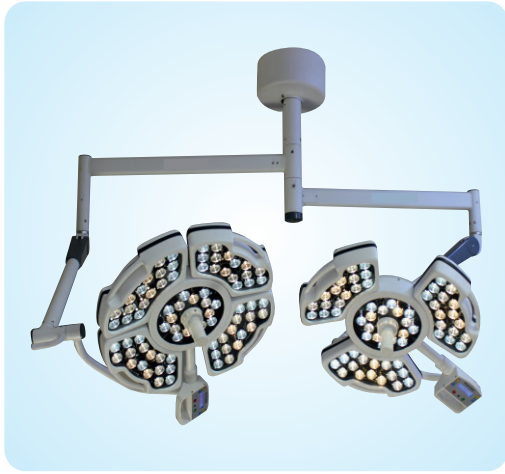
Model : Petal 43