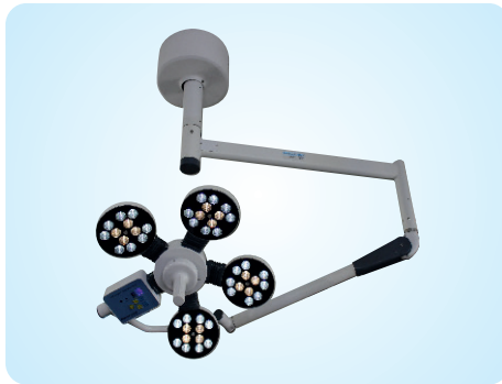
Fine Lux 4