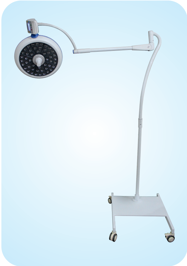
Model : Macro 500 M (Optional Battery Backup)