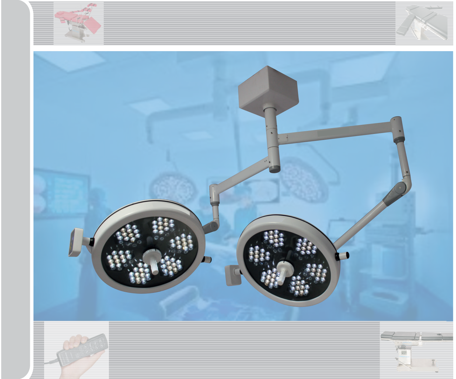
Model : Glow 6060 Double Head